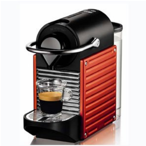
Figure 2 Capsule machine 11

Capsule machines work with high pressure of 800 kPa 10 . The hot water is pressed through small aluminium/plastic capsules filled with ground coffee. High efficiency capsule machines only have a consumption of even below 40 kWh per year (according to the measurement method of Euro-Topten/S.A.F.E.), whereas very energy inefficient machines need up to 200 kWh per year, similar to the automatic machines, due to their keeping hot and standby function. The price ranges between 80 and 250 Euros but in addition the running costs for these types of coffee machines are very high due to the costs of capsules. With an average price of 30 Cent per capsule in contrast to a portion coffee prepared by an automatic coffee machine with around 8 Cent per cup, the coffee costs are more than three times higher. The average lifetime of a capsule machine is 7 years (Market research in Germany, Juni 2011 and expert interviews of the Öko-Institut e.V.).