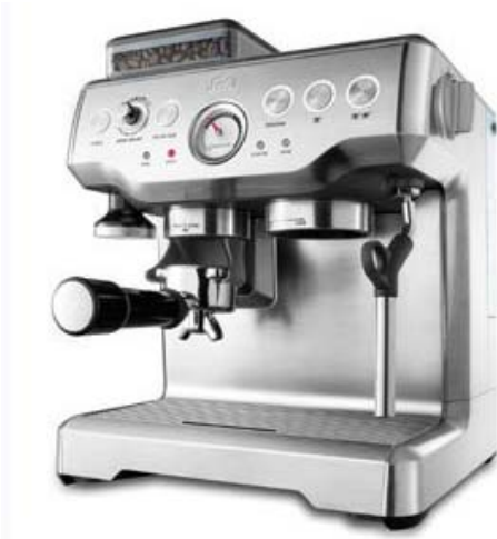
Figure 4 Semi-automatic portafilter coffee machine 15