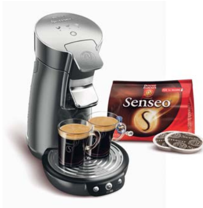
Figure 3 Pad machine 13

costs for these types of coffee machines are slightly lower than for capsule machines: their average price is 22 Cent per pad. The average lifetime of a pad machine is 7 years (Market research in Germany , Juni 2011 and expert interviews of the Öko-Institut e.V.).