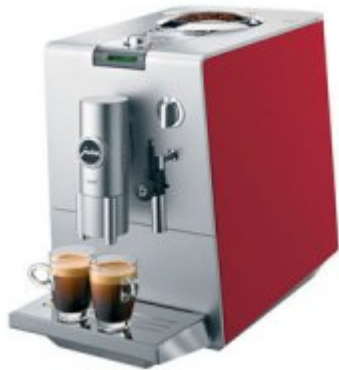
Figure 1 Fully automatic coffee machine 6

Fully automatic coffee machines operate automatically at the touch of a button and contain a complete preparation system with mill and pumps. Coffee beans are grinded to coffee grounds and are then compressed. With a pressure of at least 900 kPa 5 , the heated water (about 90°C) is pressed through the coffee powder. The coffee grounds are then automatically thrown into the pulp container and the brewed coffee goes directly into the provided cup/cups. Some automatic coffee machines even have an automated milk frothing, water filter and self-cleaning system. Most of the appliances can operate both with coffee powder and coffee beans.